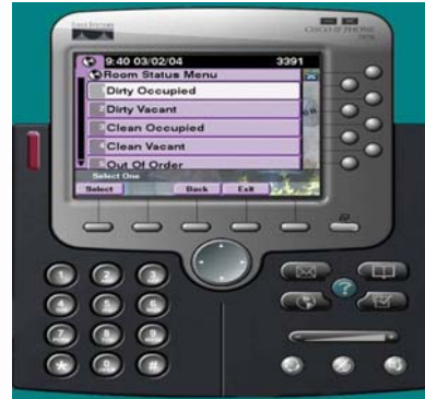
Guest Room Service