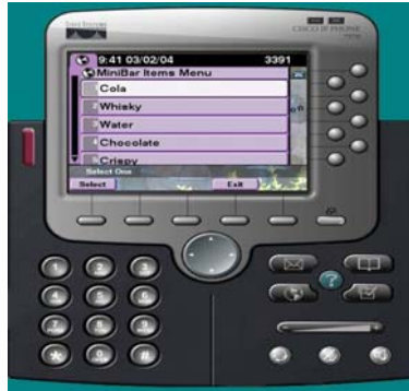
Mini Bar Service

3D TGNT Co., Ltd 5F, Shenghong Building, No.98 Eastern 3rd Ring Road South, Chaoyang District, Beijing 100021 Tel (8610) 58692700 Fax (8610) 58611008