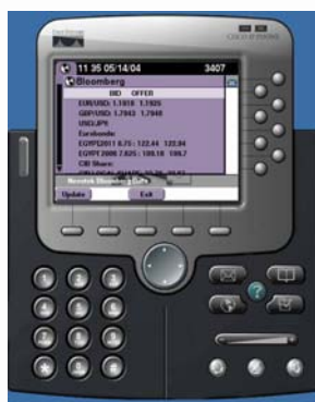
Online Stock Quote